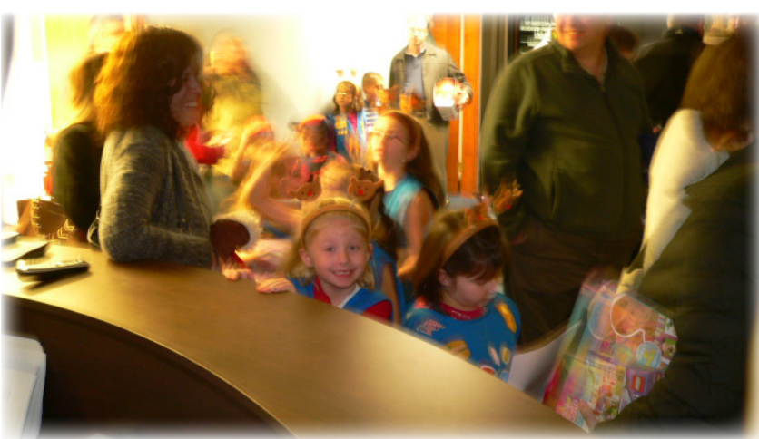
Scouting groups brought toys and other gifts for needy area families -- with the kids presenting their donations on camera at the 2015 Telethon.