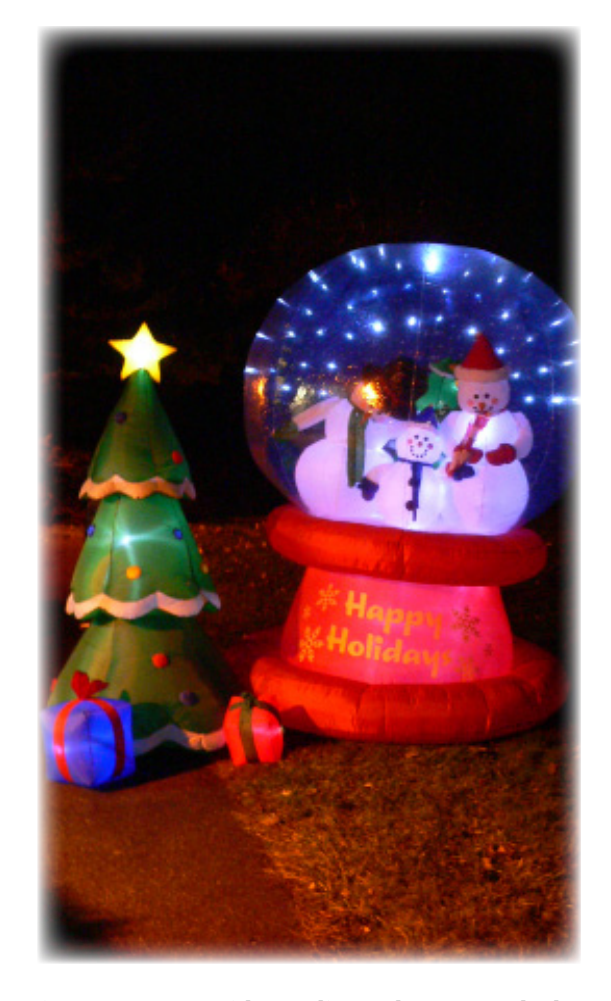
Winter scene outside studio at the 2015 Telethon.