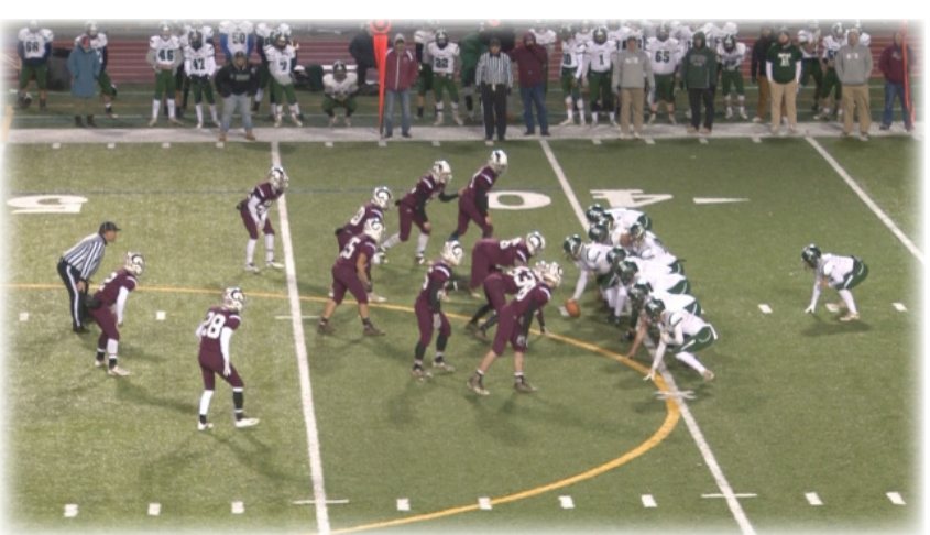
Nipmuc Football (right) defeated Northbridge Nov. 11 on their way to a Super Bowl appearance against Scituate at Gillette Stadium Dec. 1.