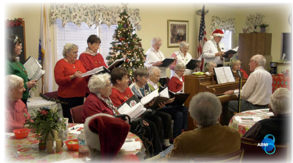
The Mendon Minstrels perform holiday program at Mendon Senior Center