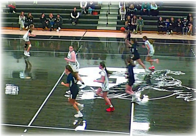
The BHS Girls Basketball team battles Med- way in Dec. 10 game at the Bellingham gym.