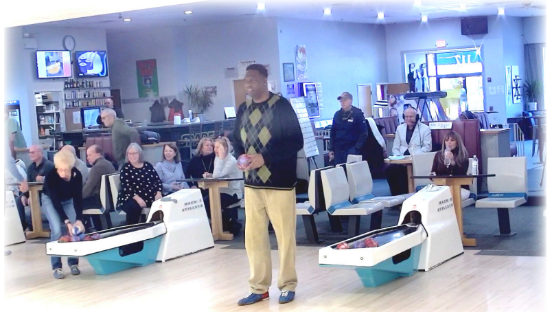
Bowling for Scholars recorded the 11th Episode of its second season recently at Sparetime Recreation in Whitinsville.