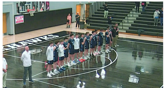
The BHS Boys Basketball team lines up for February game vs. Medfield