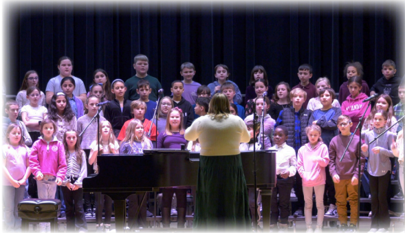
Singers harmonize during Bellingham Middle School Fourth Grade Concert in January.